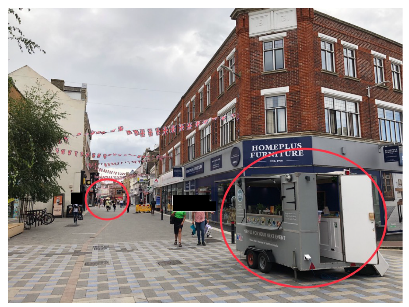
There are TWO street traders selling ice-cream on Week Street and their location is not far away to each other. (Photo took by 21 AUG 2022)